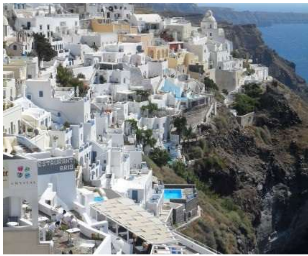
Santorini's Fira Town nestled into volcanic cliffs overlooking the Aegean Sea